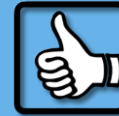
Ease of Use