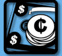
Total Cost of Ownership

Because every baby deserves the highest standard of care